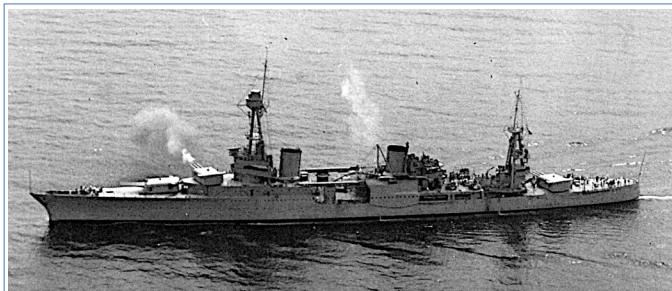
USS Houston (CA-30) firing near Chefoo, China in 1935

26 May 41, Bud was received for duty aboard the light cruiser USS Marblehead (CL-12) in Manila.