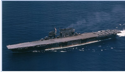
USS Saratoga (CV-3) underway 1942